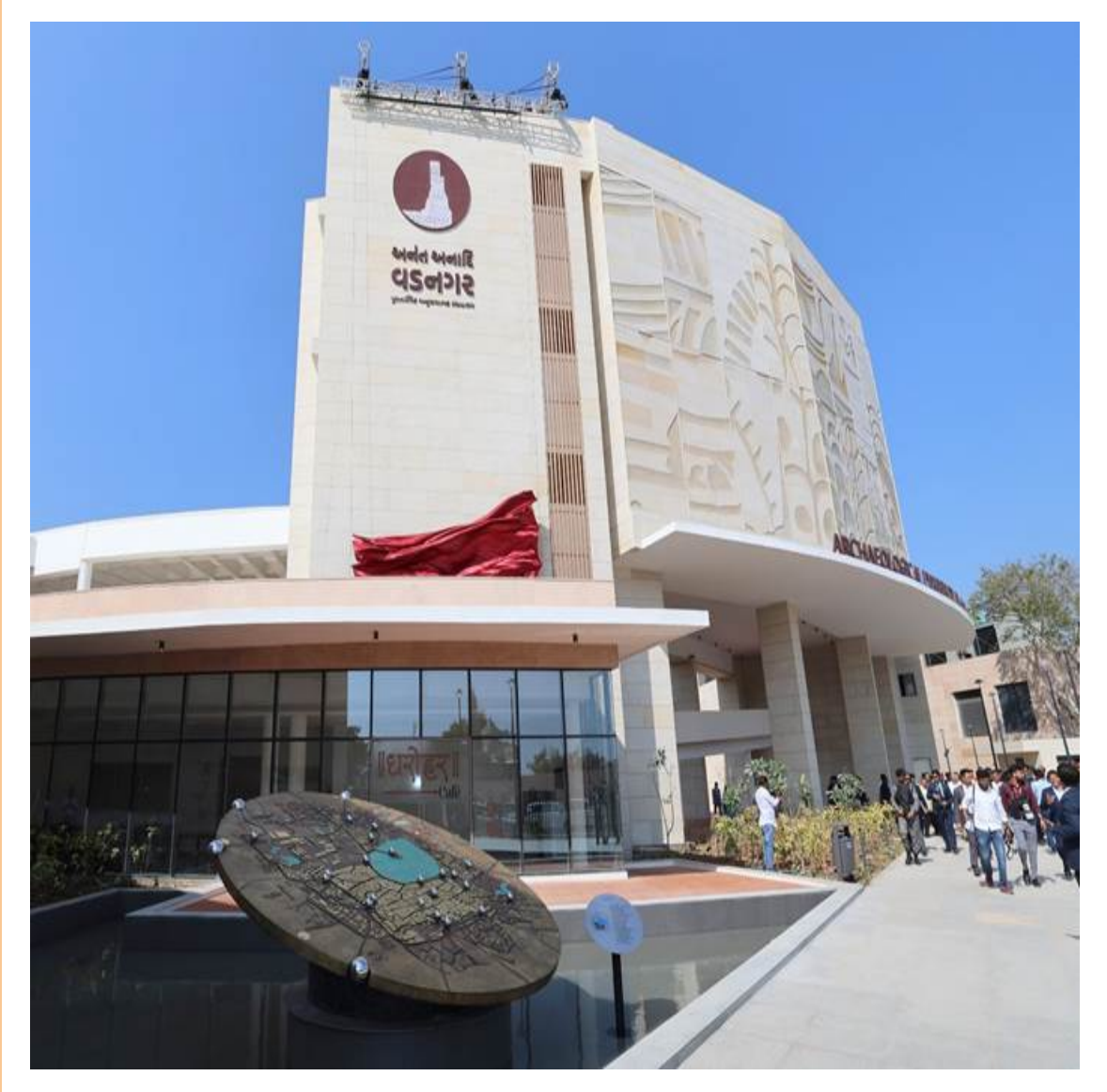
The Union Home Minister and Minister of Cooperation stated that the Panch Pran pledge propounded by Prime Minister Modi, which, among others, incorporates taking pride in our heritage, is part of his vision for the nation. He mentioned that Prime Minister Modi has given this message of Panch Pran to the youth of the country so that they are able to shed all signs of colonialism and are inspired to feel the pride in our heritage, thus empowering them to shape the future based on modernity. He said that

public reading of the Jain scripture Kalpasutra, which was traditionally read only by ascetics, took place here. He added that this place was also a Buddhist monastery, and many Buddhist monks came here to quench their thirst for knowledge. He emphasized that this place has been a center for the worship of three great religions, and the entire journey of Vadnagar, from Skanda Purana to Chamatkarpur, Anartpur, Anandpur, and Vadnagar, is depicted in this museum with illustrations.