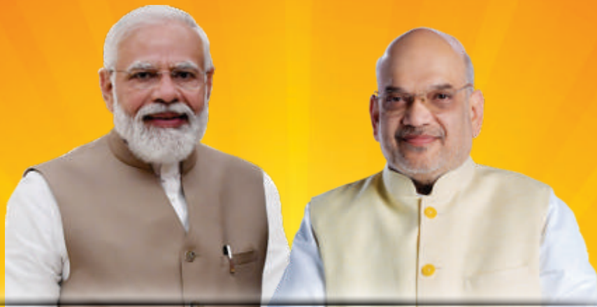
Sh. Narendra Modi