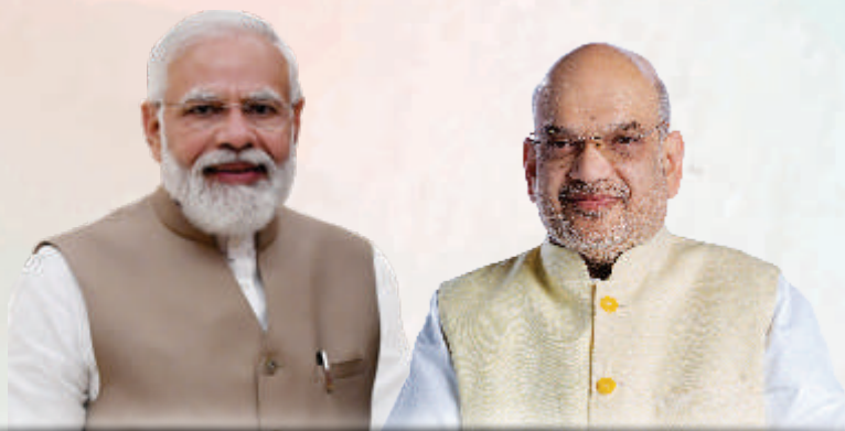
Sh. Narendra Modi